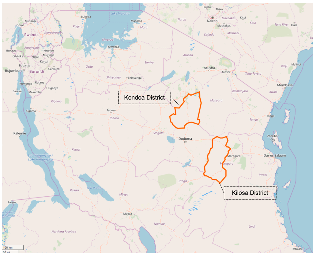
Fig. 1. Map of Study Areas in Tanzania. Notes: Figure shows the two study districts in Tanzania. Upper shape shows the administrative district boundaries for Kondo, and lower shape shows the district boundaries of Kilosa.

and credit constraints, households would only store their harvest until the lean season if expected price increases outweigh the expected quantities lost during storage. Yet, post-harvest losses during storage are substantial in Sub-Saharan Africa. A meta-analysis of measurements based on grain samples estimates maize post-harvest losses of 25.6% on average (Affognon et al., 2015). These post-harvest losses mainly occur during storage when insect infestation and mold damage the harvested produce (Affognon et al., 2015). Reducing storage losses would not only make an extended duration of storage more profitable for households, but also increase the quantity available for consumption, especially in the lean season. Hence, we argue that limiting post-harvest losses during storage could contribute to mitigating seasonal food insecurity.